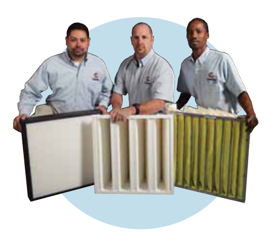
For more information on Kimberly-Clark Filtration Products, visit us online at www.kcfiltration.com.